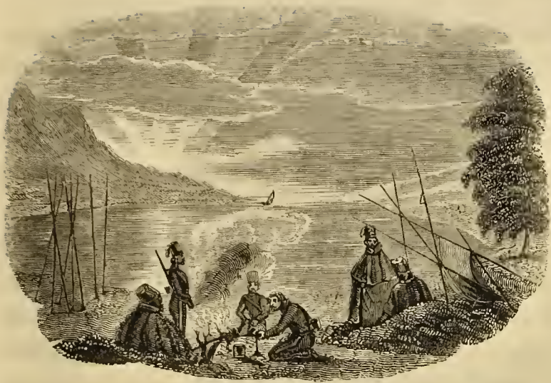
AN EVENING VIEW OF THE BAY OF SOUDJOUK-KALE.